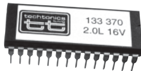
#133 370 - $100.