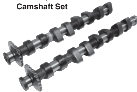
#109 076 - $380. 16V Camshaft Set

Largest VW Camshaft Selection! For 8V, 16V & VR6. From $130