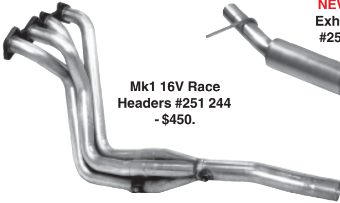
Mk1 16V Race Headers #251 244 - $450.

LARGEST watercooled VW exhaust selection 1975-2010 and several new Audi exhaust systems. T-304 stainless steel or aluminized.