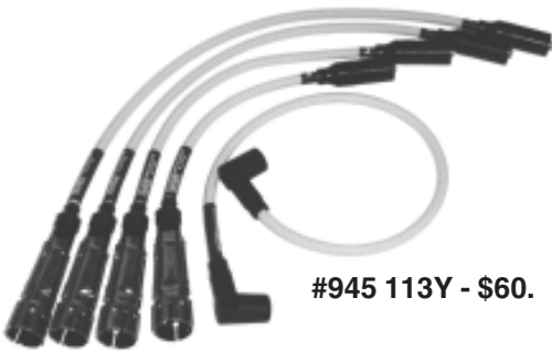
#945 113Y - $60.

Also Available for the Mk2 & Mk3 16V. Mk1, Mk2 & Mk3 8V Race Headers from $425. Tallblock Applications Also Available. Add flex joint for $45.00.