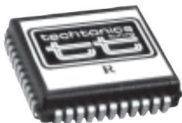
#133 362 - $100.

TT & GIAC chips available for most applications.